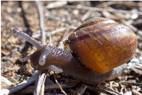
Morro Shoulderband Snail.

The Elfin Forest is home to two federally-listed endangered and threatened species, the Morro Shoulderband Snail (endangered) and the Morro Manzanita (threatened), respectively. Because the US Fish and Wildlife Service (FWS) designated the Elfin Forest and some surrounding lands as Critical Habitat for these two species in 2001, additional requirements of the Endangered Species Act (ESA) apply. The Act, found in Title 16 of the Code of Federal Regulations, was passed by Congress in 1973 and signed into law by President Richard Nixon. The law seeks to preserve and restore animal and plant species to a viable, endur-