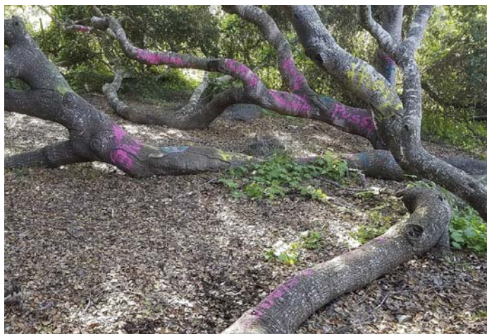
Graffiti on these oak branches were later painted over.