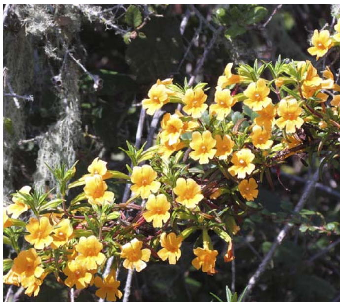
Sticky Monkey Flower

chattering flocks of tiny fuzzy gray Bushtits and Blue-gray Gnatcatchers, and similarly talkative little brown birds including several species of sparrows and wrens. Avian migrants passing through from winter homes farther south may include Warbling Vireos, Hooded Orioles, Black-headed Grosbeaks, and Yellow, Townsend’s, and Wilson’s Warblers.