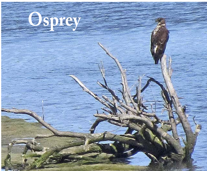
Text and Photo by Jean Wheeler, Ph.D.

Ospreys ( Pandion haliaetus ) are a single species second in worldwide raptor distribution only to Peregrine Falcons ( Falco peregrinus ), which can also be seen from Elfin Forest lookouts. We can often spot an osprey resting like this one on a snag sticking up out of Morro Bay. They nest in treetops or poles over water or along shorelines of lakes, streams, and oceans nearly everywhere in the world, except for Antarctica. Fresh fish constitute 99% of their diet, and they are the only raptors on the North American continent capable of diving into the water to catch them, although diving to only about three feet in depth.