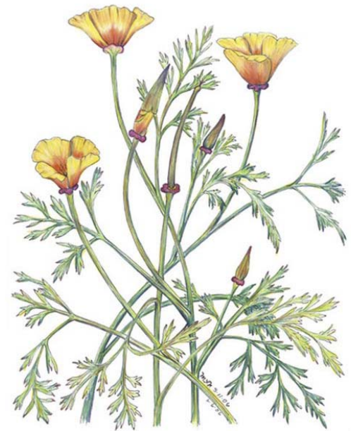
California Poppy Eschscholzia californica

Of all the 'golden poppy' species, the California poppy is the most tolerant of human activity. We see it growing in road rights-of-way, pastures, vacant lots, and in our gardens. It was one of the first California species to spread around the world. A very short-lived perennial, it is usually grown as an annual from seed. Since its roots are easily damaged it doesn't transplant well. It is best to grow it from seed planted where you want it to be. It is drought tolerant and if flowers are removed after blooming, the booming period can last months. It even tolerates those of us who lack a green thumb!