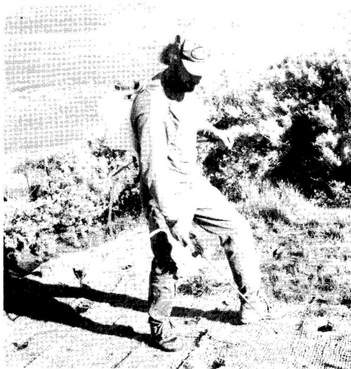
Lack of rain since January has made watering the restoration project an intensive operation for SUPER volunteers.