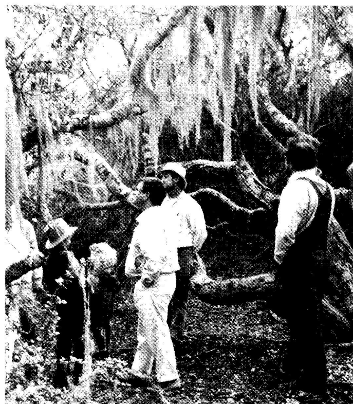
The magical allure of the lace-like lichen dripping from the oaks always captures the imagination of Elfin Forest visitors.