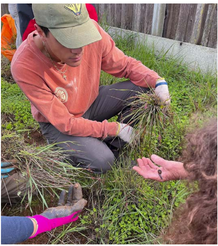
Cal Poly Water Works Club students comparing two snails found while assisting our Weed Warriors. Threatened Morro Shoulderband Snails should be moved to safe locations.