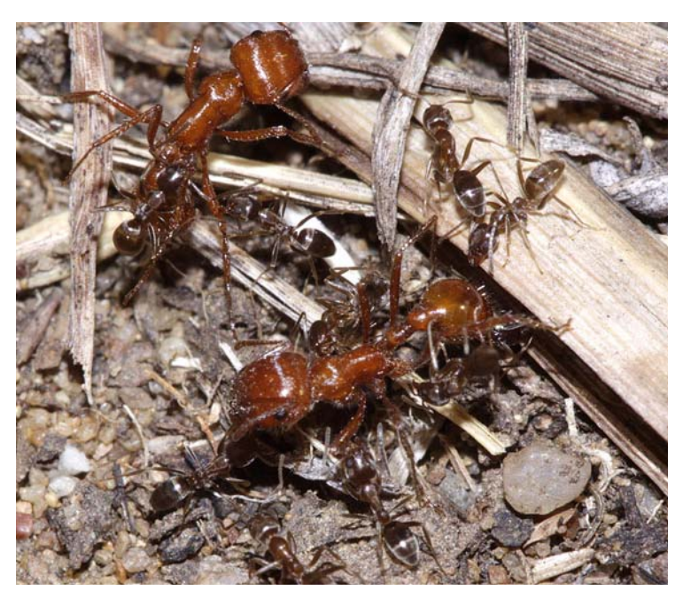
In this ant battle photographed by Dave Bowlus, at least 9 Argentine ants are attacking two harvester ants.

Argentine ants are believed to have arrived on coffee or sugar ships in the 1890's. A single harvester ant is several times the size of an Argentine ant, but the invaders live in colonies totaling tremendously more ants than a harvester ant colony. The few arriving Argentine ants were genetically much less diverse than the populations they came from that war with one another in Argentina, limiting size of colonies. Here, their colonies grow much larger, waging war on our native ant species that are not inclined genetically to eating or fighting with much smaller ants. Our native ants get overwhelmed (see photo below by Dave Bowlus) by the biomass of the invading colonies. Scientific experiments to feed young harvester ants on Argentine ants discovered that the young harvester ants all quickly lost weight. If Argentine ants replace harvester ants, we may lose our charismatic horned lizards also.