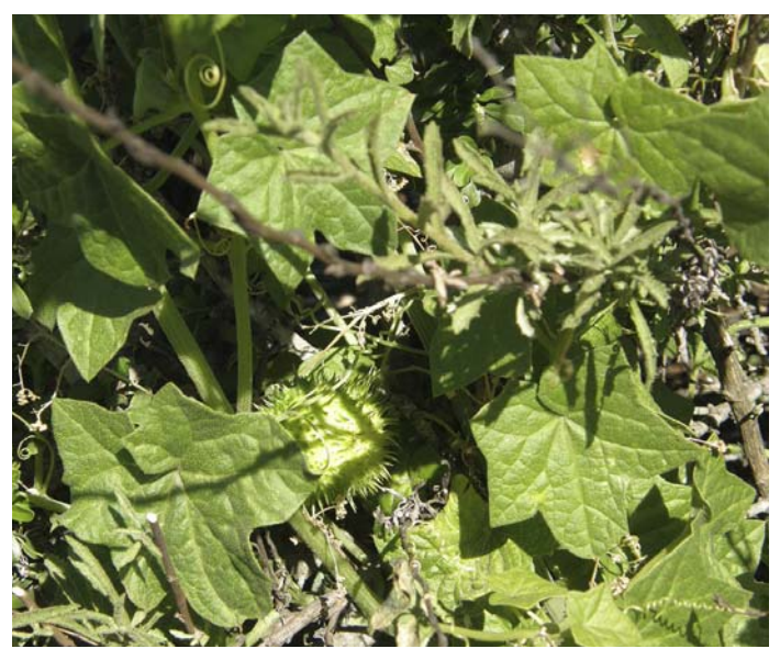
Wild cucumber fruit vine with leaves and fruit, a native plant present above ground only a few spring months each year.

While admiring butterflies and flowers, your eyes will no doubt also be attracted by the flight of avian residents, such as the black phoebe (pictured). . Especially likely to be seen and heard are the bright blue California scrub jays, plump California quail with amusing head plumes, orange and black spotted towhees, chattering flocks of tiny fuzzy gray bushtits and bluegray gnatcatchers, and similarly talkative little brown birds such as sparrows and wrens. Avian migrants resting here as they pass