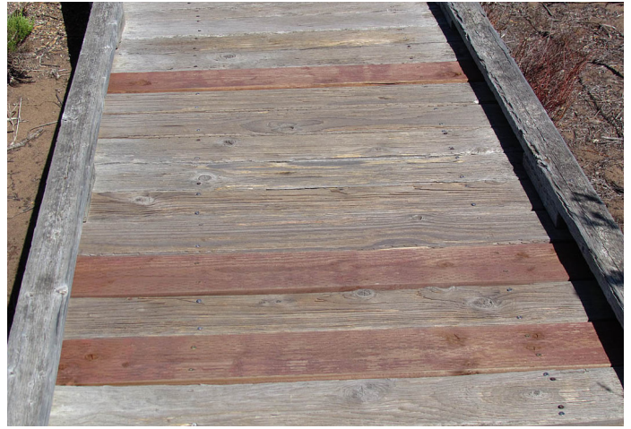
Replacement boards show up among the old now in our boardwalk.