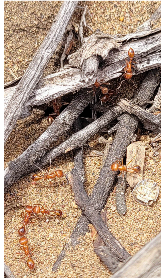
Harvester ants, the major item in the diet of coast horned lizards. There is concern that tiny Argentine ants invading the Elfin Forest may be displacing the larger harvester ants without replacing them in the diet of coast horned lizards, thereby endangering the lizards.

In all things of nature, there is something of the marvelous. ~ Aristotle ~