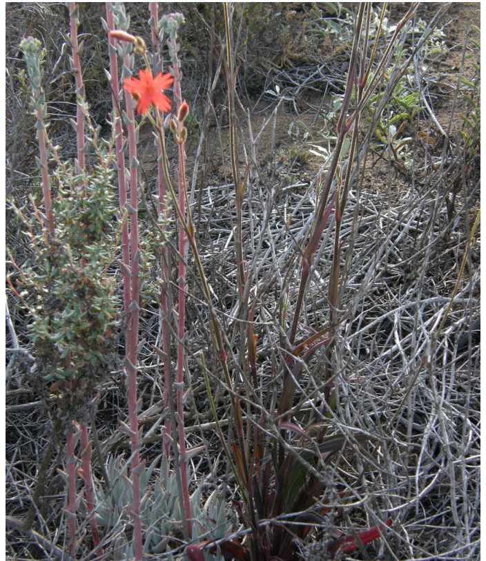
Cardinal Catchfly. Also, see article on page 5.

Horned, eared, pied-billed, western, and Clark’s grebes also arrive from September to November remaining until March or April. Shorebirds such as sandpipers, dowitchers, and the American avocet (pictured) reach peak populations by winter.