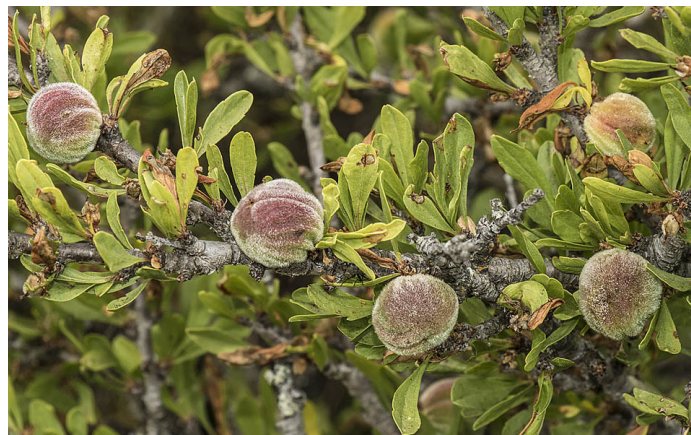
Dune or Sand Almond with fruit.

Several of our coastal species can be paired with forms found growing in our interior deserts. If you look carefully at any two groups of individuals of the same species growing in widely separated areas, you will find describable differences in appearance, physiology, and even basic ecology between them. This is certainly true of our coastal and the desert sand almonds. Our coastal plants are more prostrate and possibly possess shorter and broader petals than the same species that grows in the Mojave and Colorado deserts. These differences led Dr. Hoover to recognize our coastal plants as a distinct species, which he gave the name, Prunus punctata . The Jepson Manual , however, currently identifies our coastal almonds as a variety ( Prunus fasciculata var. punctata ).