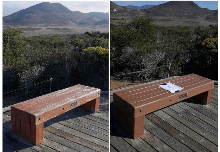
One of the Elfin Forest "Benchy" benches before and after being rejuvenated this November.