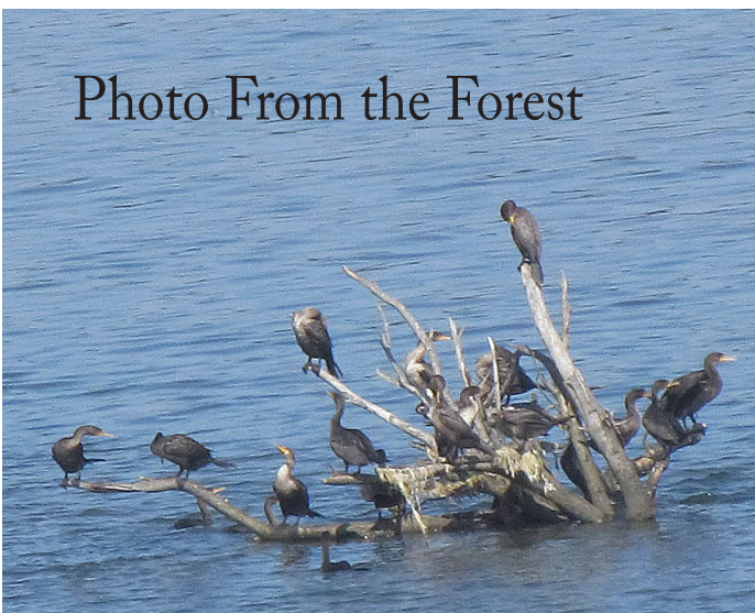
Photo From the Forest