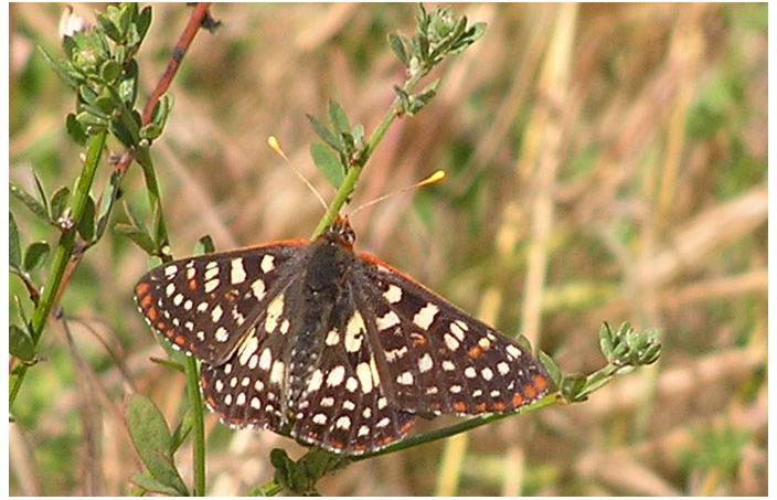
(above) Variable Checkerspot Butterfly (Euphydryas chalcedona) (at left) Suffrutescent Wallflower (Erysimum insulare suffrutescens)

Sticky monkey-flower plants are leafing out and we hope that the heavy rain came in time to support their orange flowers. Other spring plants that we hope respond to the late rain with a light to moderate show of blossoms include coastal dudleya and suffrutescent wallflowers (both yellow), California hedge nettle and cob-